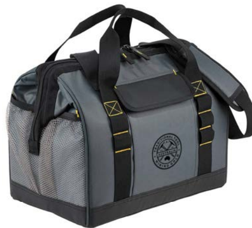
AZ1006 Arctic Zone Workmans Crib Cooler 18L Heavy duty materials make this crib cooler ideal for the toughest job. Dual carry handles and adjustable padded shoulder strap. Ultra safe leak-proof PEVA lining.