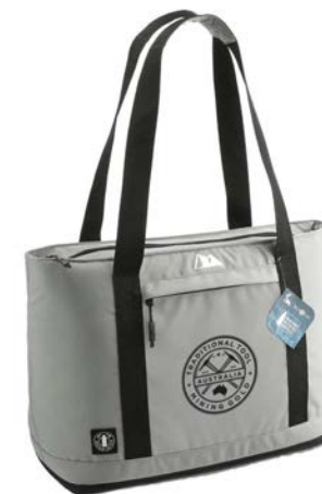
AZ1026 Arctic Zone® Repreve® 25-50 Can Expandable Cooler 36L Expandable RPET Cooler is a great tote-style that expands to hold up to 50 cans! Made from REPREEVE® recycled 600d polyester.